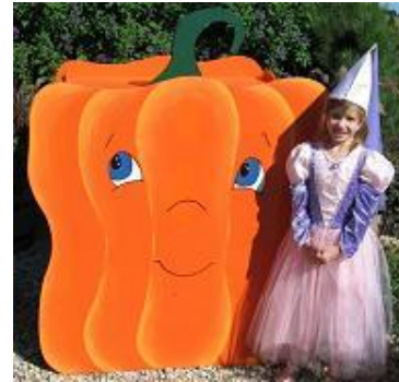
"SPOOKLEY" WITH A YOUNG FAN